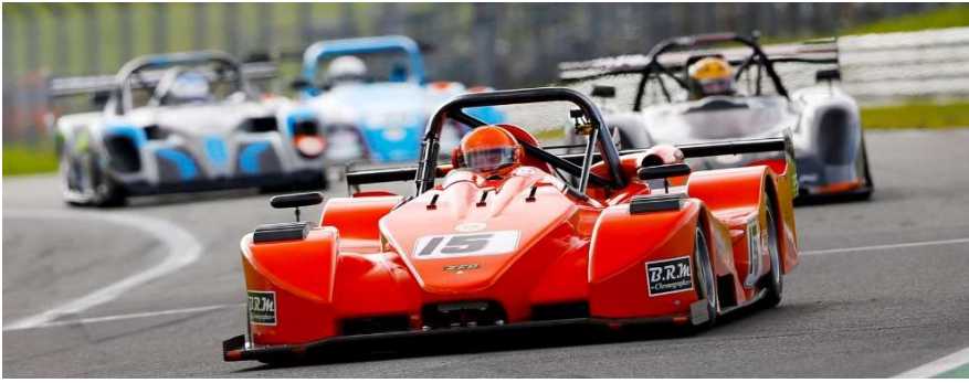
CTR01 winning ZEO Prototypes on Brands Hatch Circuit, August 2022