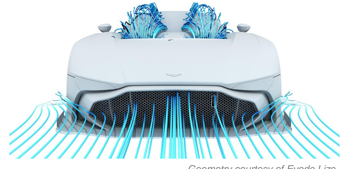
Geometry courtesy of Evode Lize